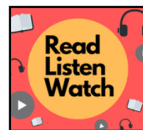
LET'S CATCH UP!